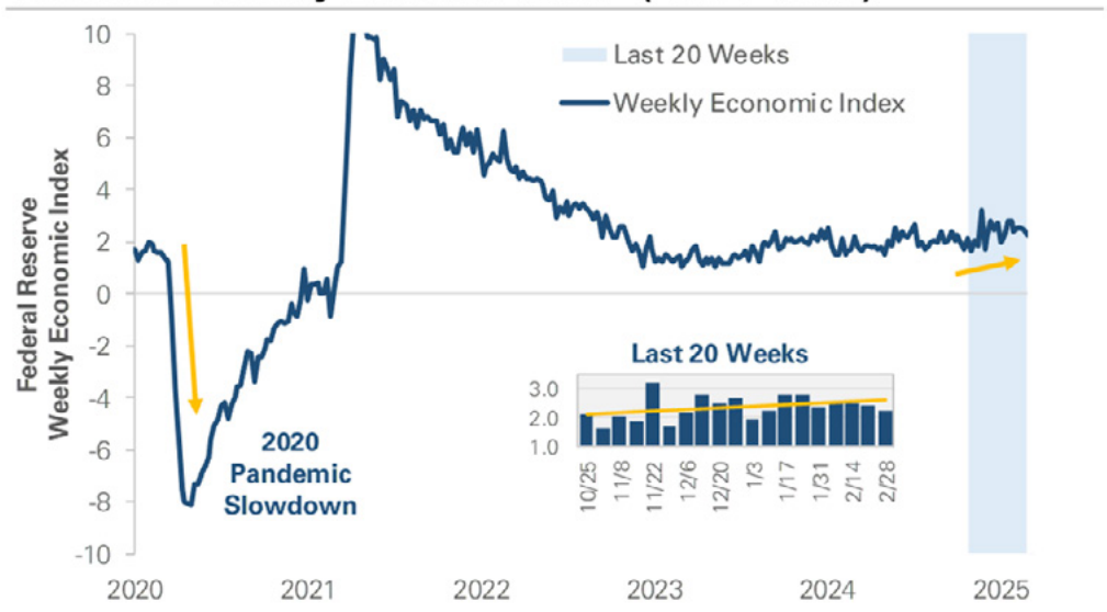
FIGURE 3 – Weekly Economic Index (Last 5 Years)

The Weekly Economic Index (WEI) is composed of ten high-frequency indicators, including unemployment insurance claims, fuel sales, electricity output, retail sales, rail traffic, tax withholding, steel production, consumer sentiment, and two weekly economic surveys. Time Period: January 3, 2020 to February 28, 2025 (latest available data as of March 11, 2025).